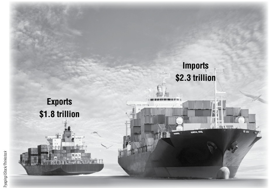
▲ The United States is one of the world's largest exporters and importers.

Global trade is significant to the U.S. economy. As one of the world's largest exporters and importers, the United States exports roughly $1.8 trillion worth of goods and services each year. At the same time, the U.S. imports more than $2.3 trillion worth of goods and services. What does this all mean for the U.S. and its trading partners? Read on to find out.